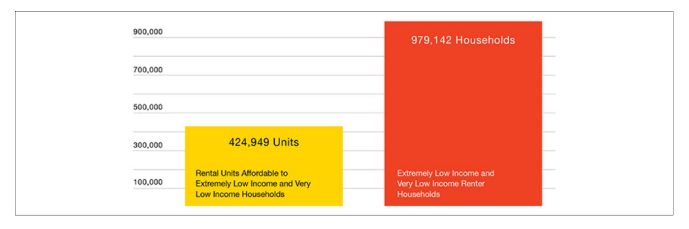
Figure 2. Supply and demand among extremely low-income and very low-income renter households.

One obvious observation is that there are more lowincome residents who are becoming rent-burdened than the plan is designed to help. In 2016, the American Community Survey (ACS) indicated that more than half of the city residents are rent-burdened. New York City Rent Guidelines Board (2018) reported that "Rent stabilized tenants report a median gross rent-to-income ratio of 36.0%, meaning a majority of rent stabilized tenants are not able to afford their apartments" (p. 10). Sugar (2016) stated that